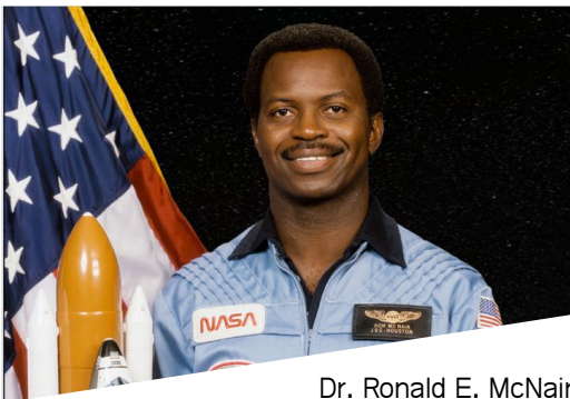
Dr. Ronald E. McNair

Dr. McNair was nationally recognized for his work in the field of laser physics. He flew his first mission as an astronaut in 1984 and died tragically at the age of 35 when the Challenger space shuttle exploded on lift off in January 1986.